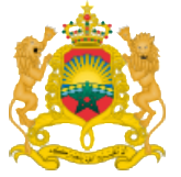
Coat of arms