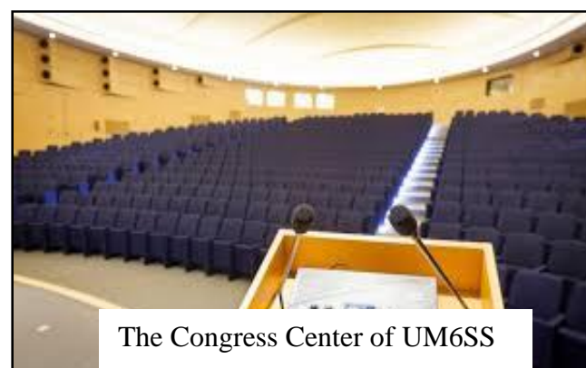
The Congress Center of UM6SS

The plenary session will be held at the Congress Center of the university. Sessions and workshops will take place at different meeting and training rooms.