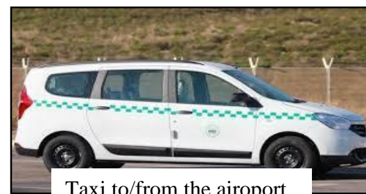
Taxi to/from the airport

After having done all the customs procedures and after having recovered your luggage, you go outside of the airport where you will find taxis that can take you to your hotel. Price: 300 MAD (~35 dollars).